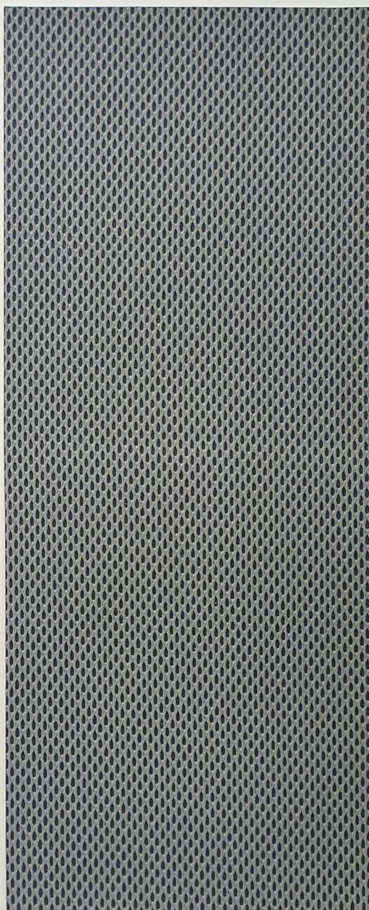
KX-614 Medium Grey