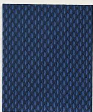
KX-611 Dark Navy