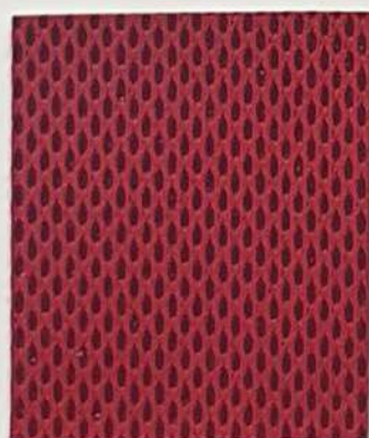
KX-612 Dark Red