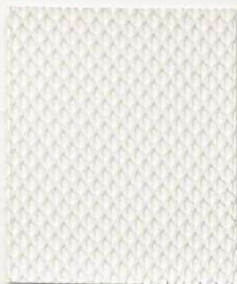
KX-602 Pearl White